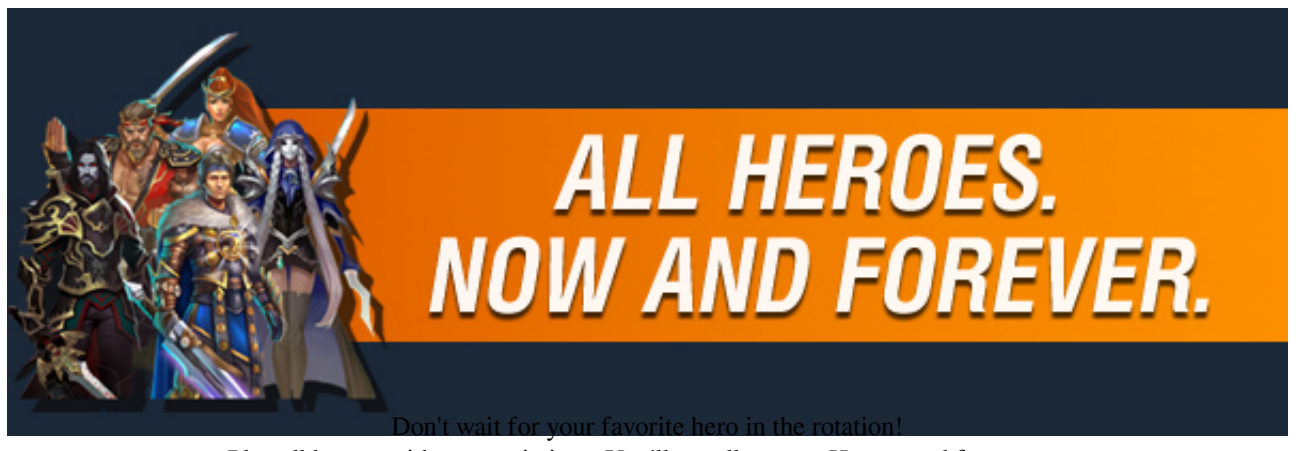
Play all heroes with no restrictions. You'll get all current Heroes and future too.